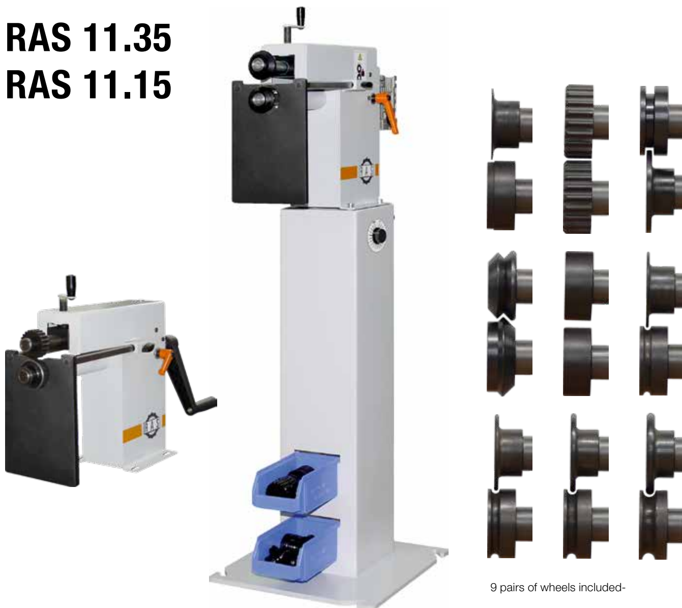
9 pairs of wheels included-