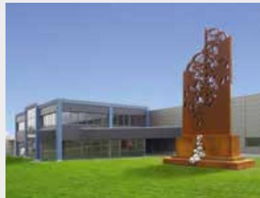
Effringen - factory and artwork