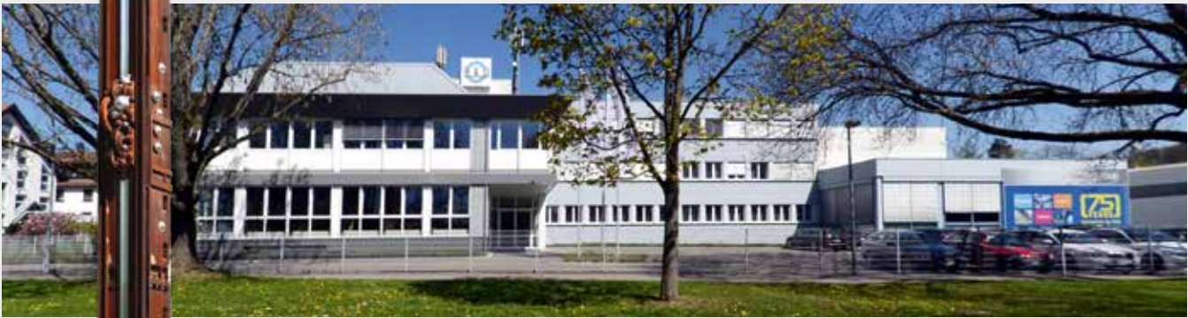
Headquarters in Sindelfingen. In the foreground „Steel object“.