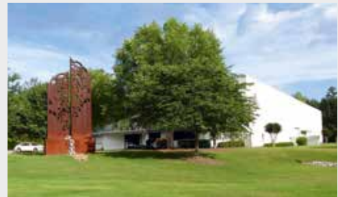
RAS Systems LLC in Georgia, USA