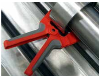
Stiffening pliers reduce shaft deflection for consistent radii.