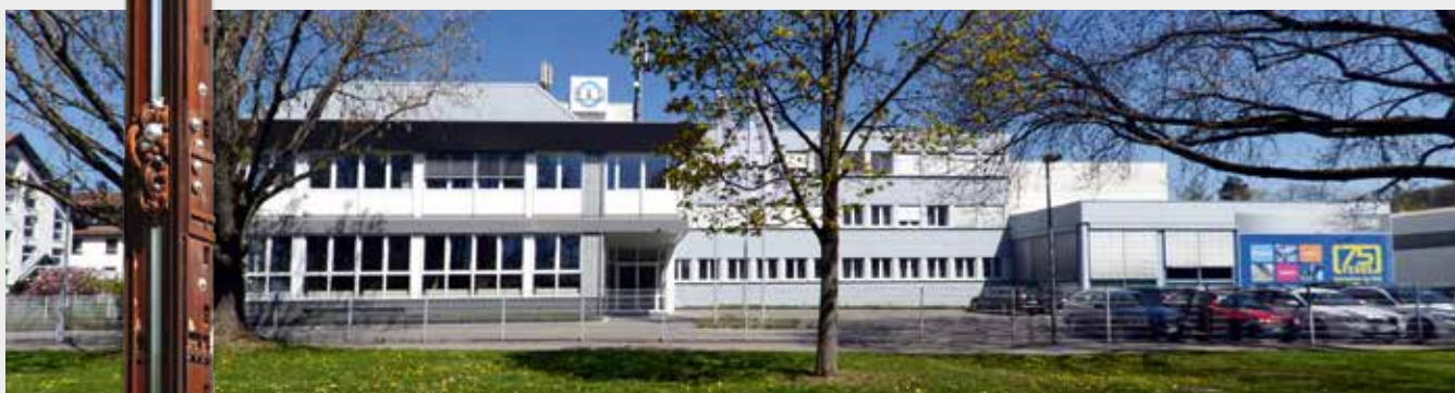
Headquarters in Sindelfingen. In the foreground „Steel object“.