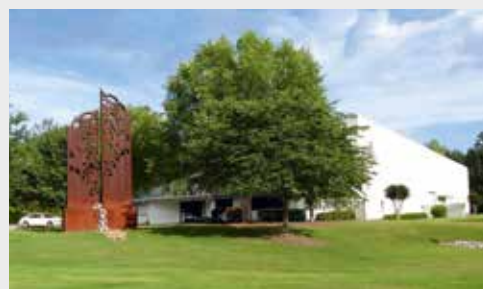
RAS Systems LLC in Georgia, USA