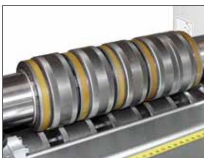
Rolls for standing seam and snap-lock seam.