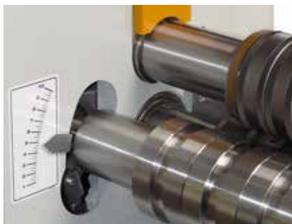
Scale for radius adjustments