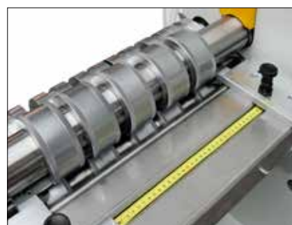
Tape measure for quick roll positioning