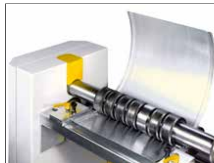
Rolls easily adjustable to the width of the part