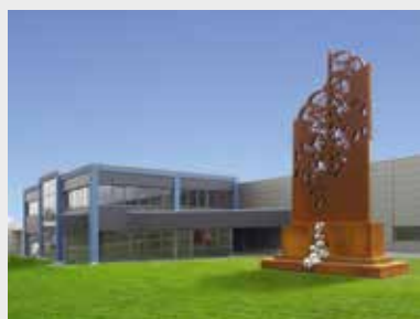
Effringen - factory and artwork