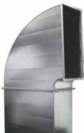
For rounding elbow blanks with Snaplock, Pittsburgh or Standing seams.